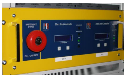
Figure 1 – Black start controller unit.

A number of alarms will also be available to allow for any issues to be highlighted and monitoring will also be available through the Black Start unit.