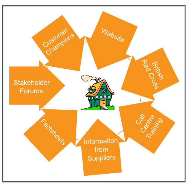
Figure 2 Methods to identify vulnerable customers

The discussions that we have taken forward as part of our RIIO-ED1 stakeholder engagement have highlighted that there is further action that we could take to keep these records up to date and we intend to explore these during RIIO-ED1. These initiatives are discussed in more detail in the sections below regarding stakeholder engagement and vulnerable customers.