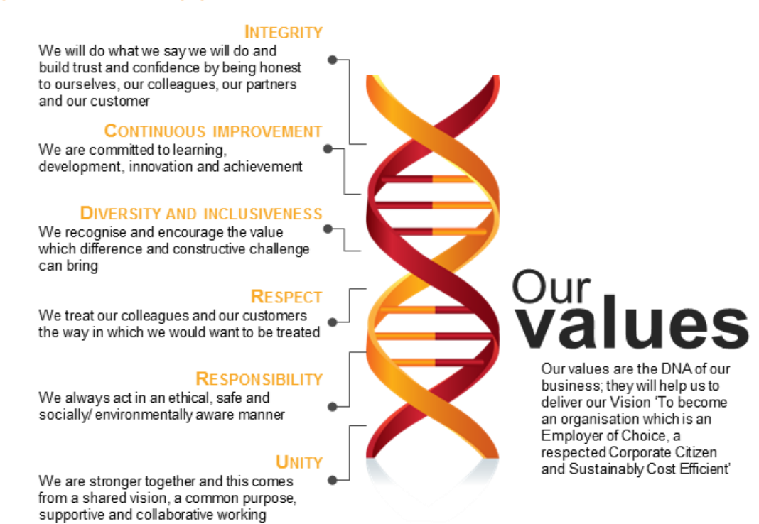
Figure 1 Stakeholder engagement is at the core of our values

As illustrated in Figure 1, stakeholder engagement is at the core of our values.