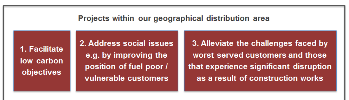
Figure 3 Criteria for approval under the Community Investment Fund

There are three funds available under the scheme and each covers a respective UK Power Networks' licence area. Under the scheme £300,000 of funding will be made available, £100,000 in each licence area in the first year of the programme. Through partner collaboration, we have also secured funding from the British Red Cross, Wildlife Trusts, Education bodies, public safety bodies, the charity aid foundation and BitC membership. In total these contributions comprise £190,500 which means we are able to make available £490,500 in total across our three licence areas. The available funds will be split equally between these three areas, recognising that although the SPN and EPN areas are significantly bigger, the LPN area is facing the biggest customer service challenges.