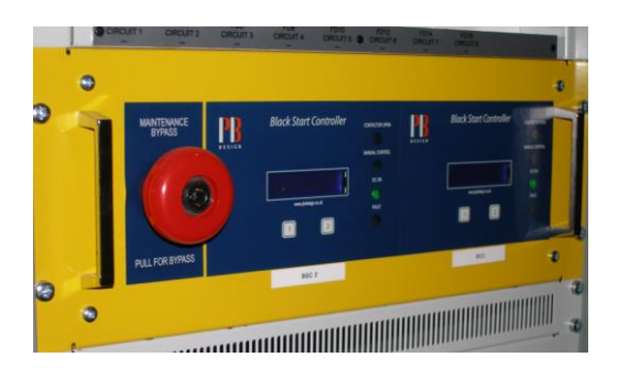
Figure 1 – Black start controller unit.

All of the cost numbers displayed in this document are before the application of on-going efficiencies and real price effects.